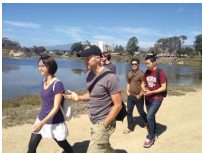
PEPP students get to know one another while walking around the lagoon on campus.

and study very practical problems (e.g., climate change, air and water pollution, the difficulties of siting "public bads" such as energy production and waste dumps) and scholarship is enhanced when individuals from a variety of disciplines are able to easily engage with one another. With so much campus wide interest in studying environmental politics, there are several forums for bringing the diverse range of people together to work collaboratively and share their own research. A recent addition is the campus Center for Social Solutions to Environmental Problems (CSSEP). The Center brings together faculty from Political Science, Bren, Environmental Studies, History, Sociology, Psychology & Brain Sciences, and Global Studies. CSSEP, which has hosted two annual conferences on Environmental Policy, will strengthen the ties among researchers at UCSB and encourage more collaboration and cross-fertilization of ideas.