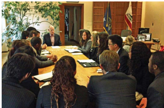
Executive Fellows meet with California Governor Jerry Brown