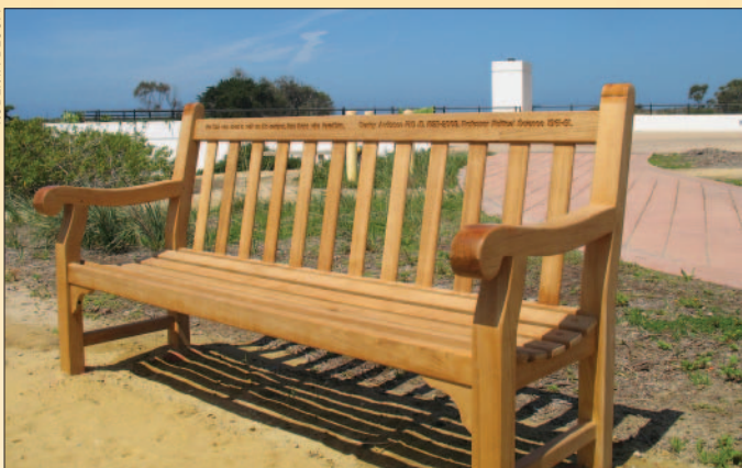
ANDERSON MEMORIAL BENCH—SEE PAGE 7