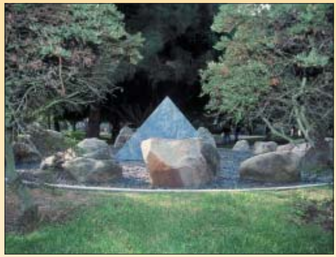
PEACE PYRAMID, UCSB

As he stated in a letter to a UCSB colleague, "I agreed to run the outfit for a few years in order as much to bust, or at least begin to bust, the hiring practices that prevail in, and are killing, most large Japanese organizations, especially academia, as to contribute to the promotion of peace research in this part of the world. To put it bluntly, I wanted to make history, once in my lifetime, which is quickly running out!" His colleagues and friends wish him the greatest success.